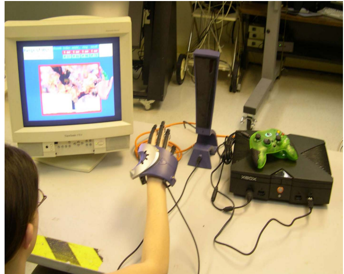
Fig. 1: Overall view of the experimental low-cost finger training system.

A P5 glove (made by Essential Reality) is connected to the Xbox USB adapter. The P5 glove measures the flexion of all fingers as well as the wrist position vs. a "base station" tower [22]. It has an ergonomic design, with the sensing structure weighing only 4.5 oz (128 grams) and being placed on the back of the hand. Each finger sensing structure has one resistive bend sensor, which measures the global bending with a 3.0-degree maximum resolution over a range of 0 to 90 degrees. The wrist 3D movement (translations and rotations) is tracked optically using infrared LED mounted on the backhand connector. This allows wrist measurements to be done 60 times every second, while the hand is kept at up to 4 feet (1.2 meters) from the base station. The base station in turn is connected to the Xbox over the USB adapter, transmitting the patient's hand gestures. In our experiments only the finger flexion data were used, as described in Section 3.